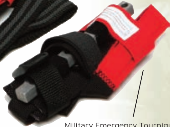
Military Emergency Tourniquet (M.E.T.) TQS-MET-T-T