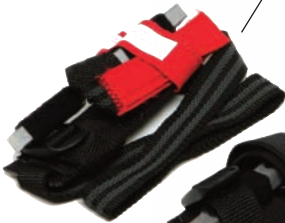
Military Emergency Tourniquet (M.E.T.) TQS-MET-R-B

Item # TQS-MET-R-B Weight: 1 lb NSN: PENDING