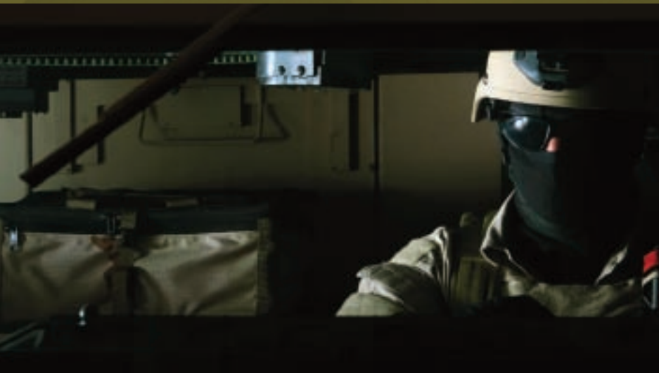
TQS Corporate Office

The TQS mission is to provide our customers with the finest state-of-the-art individual and small unit equipment to enhance their safety, improve their response quality, and increase their combat effectiveness. With the ability to provide custom-designed products supported by innovative logistics solutions, TQS is truly taking tactical equipment procurement and logistics support to the next level. Our company values – the highest level of professionalism fueled by teamwork, communication, education, accountability, and quality service - result in a proven track record of delivering “best value” to customers all over the world.